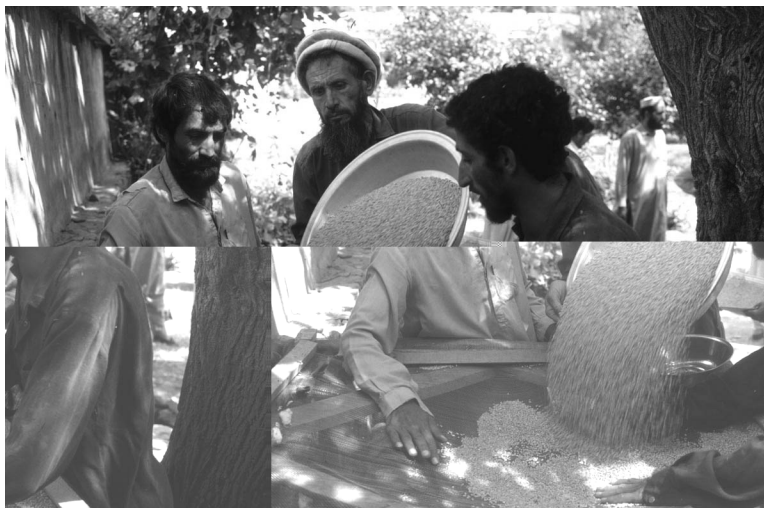
In Afghanistan, farmers' seeds that are not sold commercially are exempted from registration and certification

Certification goes hand in hand with seed quality control in which the most important seed qualities - viability, purity and health - are tested in a laboratory, commonly using internationally harmonised procedures of the Organisation for Economic Cooperation and Development (OECD) or International Seed Testing Association .